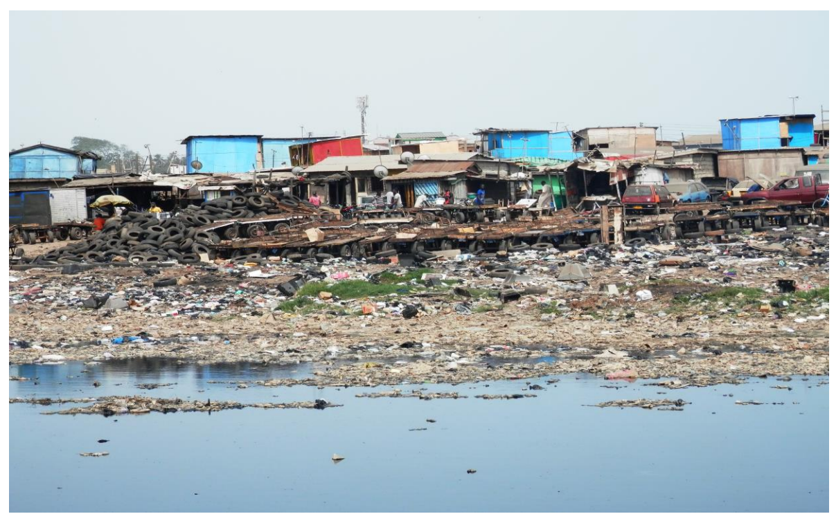
Plate 2: Dumping of refuse has resulted in the pollution of the Odaw River.

Apart from living in unhygienic environments, the migrants generally do not have access to basic services (Table 5). About 92 per cent of those in Old Fadama and 60 per cent of those in Nima do not have access to water within their residences. As a result, they buy water on a daily basis from neighbours or use water from wells. Again, 94 per cent of the migrants in Old Fadama and nearly 63 per cent of those in Nima do not have toilet facilities within their residences. Lack of bathing facilities is also a major challenge, especially for those in Old Fadama, where a very high proportion (88.6 per cent) do not have a bathhouse in their residences. Consequently, these people have to use a public bathhouse, where they pay 50p ($.25) each time they have to bath (see plate 3). The majority of the respondents (88.3 per cent), however, have electricity supply in their homes.