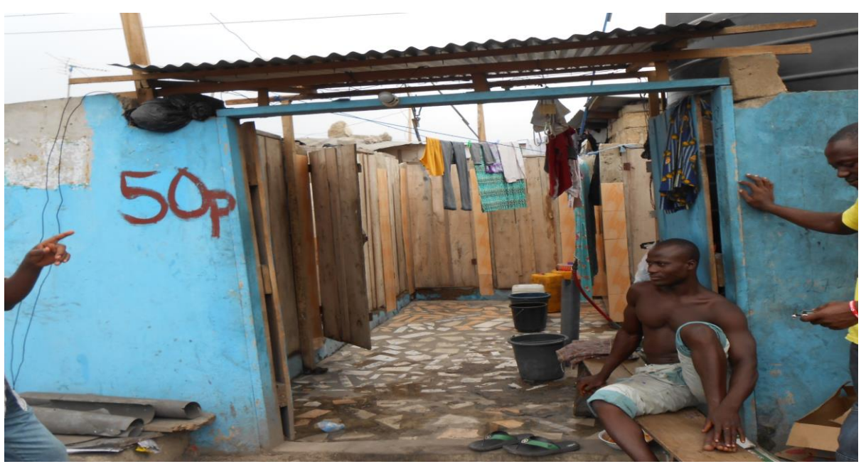
Plate 3: Private bath houses for commercial purposes.

It is important to state that not only are these facilities generally unavailable, but the migrants also end up paying more for these services than those in higher income neighbourhoods. For instance, the average cost of 1000 gallons of water in Ghana is 80peswas (40 cents), but migrants pay 30pesewas (15 cents) per bucket, which is roughly 2 gallons. These poor migrants are also required to pay money each time they visit the toilet. Consequently, people without money tend to defecate in a nearby bush, thereby further contributing to the pollution of their living environment. City officials who were interviewed indicated that the poor environmental conditions in these slums, coupled with limited access to basic necessities, have created conditions for flooding and diseases such as typhoid fever and cholera, thus confirming the findings from other studies that indeed many migrants move towards heightened environmental risk, not away from it – often as part of rural-urban migration (Foresight 2011). Srivastava (2005) reported similar scenarios in India, where most poor internal migrants live in urban slums under unhygienic conditions.