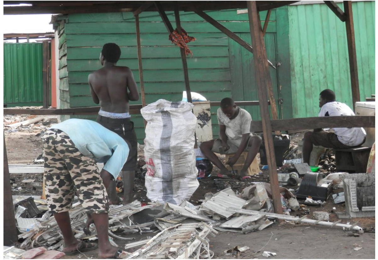
Plate 4: Migrants working in the e-waste business.