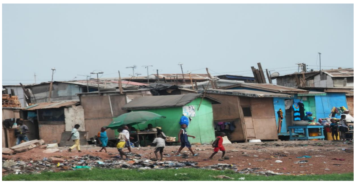
Plate 1: Wooden shacks and kiosks serving as homes for migrants in Old Fadama.

The working environments were also very poor and generally unhygienic. Observation of the area, indicated that the activities of the migrants have contributed to the deplorable state of their living environments. This is especially the case in old Fadama where the e-waste dealers have heavily polluted a nearby stream (see plate 2). Nevertheless, the majority of respondents (96 per cent in Nima and 94 per cent in Old Fadama) do not think that their economic activities are responsible for the unhygienic nature of their living and working environments.