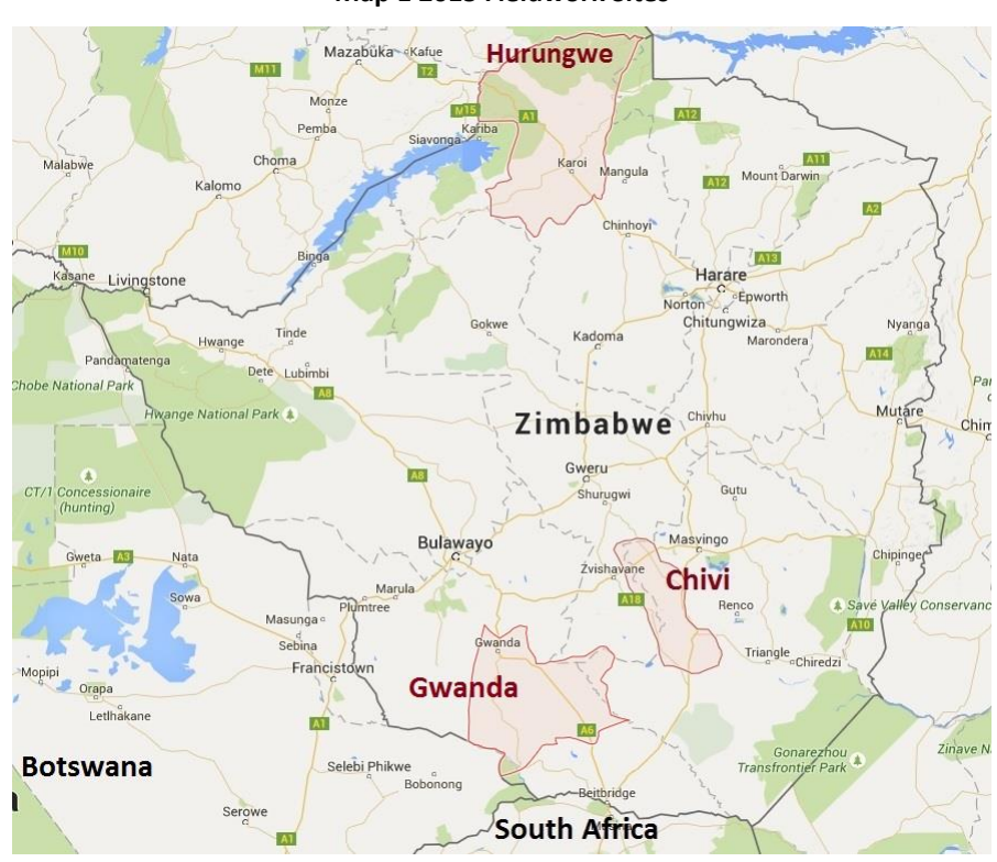
Map 1 2015 Fieldwork Sites

This study was undertaken in three districts in Zimbabwe, namely Chivi in Masvingo province in the south-east of the country, Gwanda in Matelebleland province in the south-west and Hurungwe in Mashonaland West province, in the north, areas where the CASS team in collaboration with WITS had already conducted qualitative research and had established relationships with district officials and village elders.