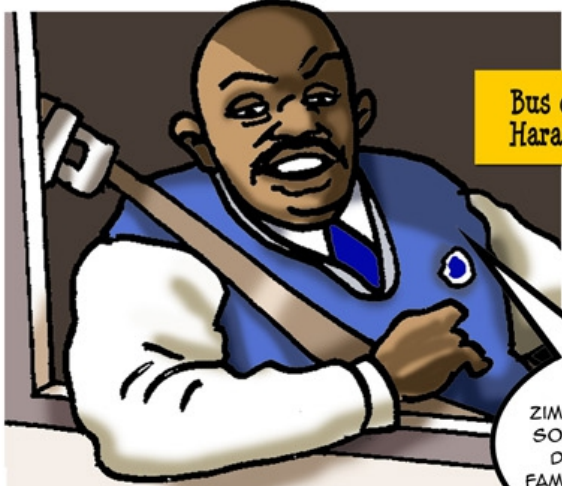
Bus driver, 40, operating the Harare - Johannesburg route.

IN 2007 THINGS WERE TOUGH IN ZIMBABWE. I WANTED TO GO TO SOUTH AFRICA TO WORK, BUT I DID NOT WANT TO LEAVE MY FAMILY. BECOMING A BUS DRIVER WAS THE BEST OF BOTH WORLDS